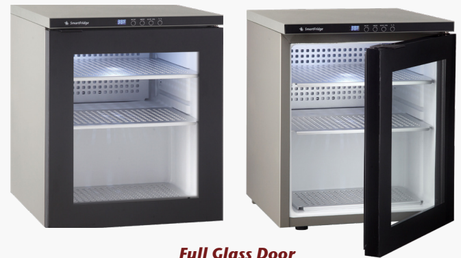
Full Glass Door