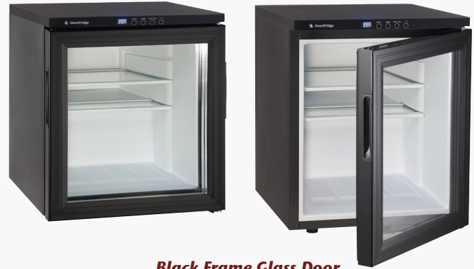
Black Frame Glass Door