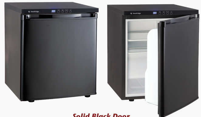
Solid Black Door