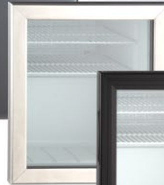
Stainless Steel Glass Door