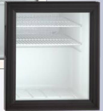
Black Metal Glass Door