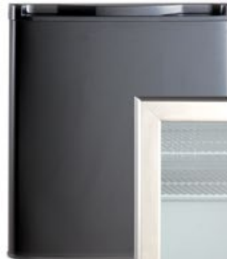
Solid Black Door

(Available for both SmartFridge and GuestFridge Models)