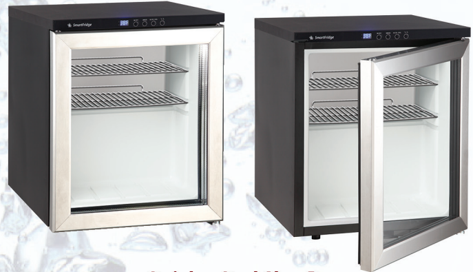
Stainless Steel Glass Door