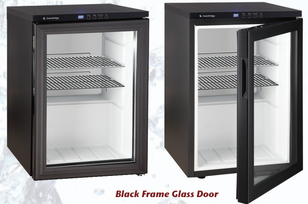
Black Frame Glass Door